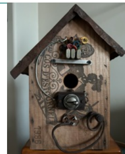
Vivienne Tuscadora A Good Year

Do you collect interesting objects or unusual images and think, " I will make something with this someday. " Use your ideas sparked by random finds and a variety of mediums (paint, textiles, paper, clay, wood, etc.) to create your artwork for the eclectic exhibit.